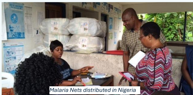
Malaria Nets distributed in Nigeria

If you are aware of shipping companies you have used, please pass that along to us so we can share that information to others on our distribution list.